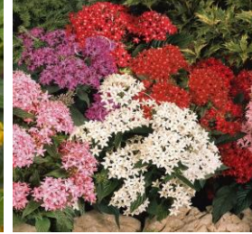
Pentas - Sun