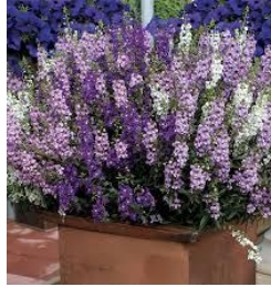
Angelonia - Sun