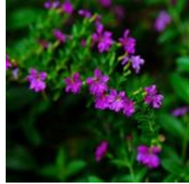
Mexican Heather - Sun