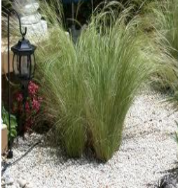
Mex Feather Grass - Sun(Gal)