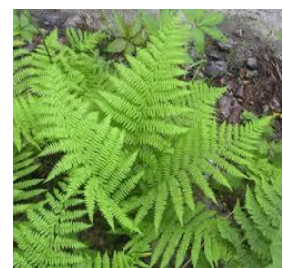
Ferns - Wood - Shade (Gal)