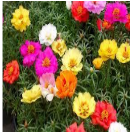
Moss Rose - Sun