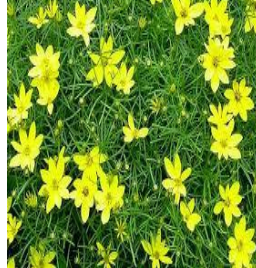
Coreopsis - Sun (Gal)