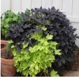
Potato Vine - Sun