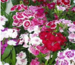
Dianthus - Sun