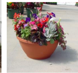
Color Bowls - Sun/Shade