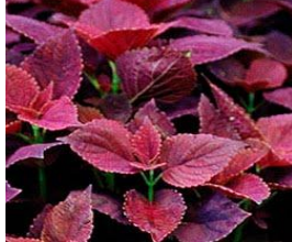
Burgandy Sun Coleus-Sun