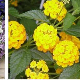
Lantana - Sun