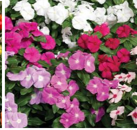
Vinca - Sun