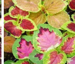
Coleus Wiz Mix - Shade