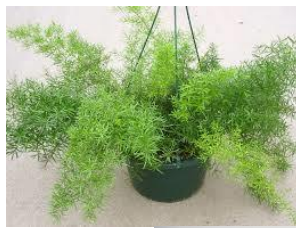
Asparagus Fern Baskets