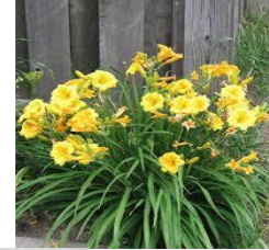
Day Lillies - Sun (Gal)