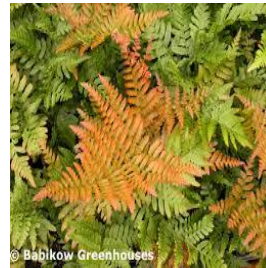
Ferns - Autumn - Shade (Gal)