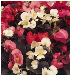
Begonias - Sun