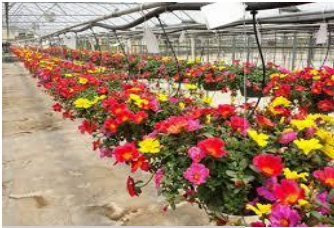
Purslane Mix Baskets